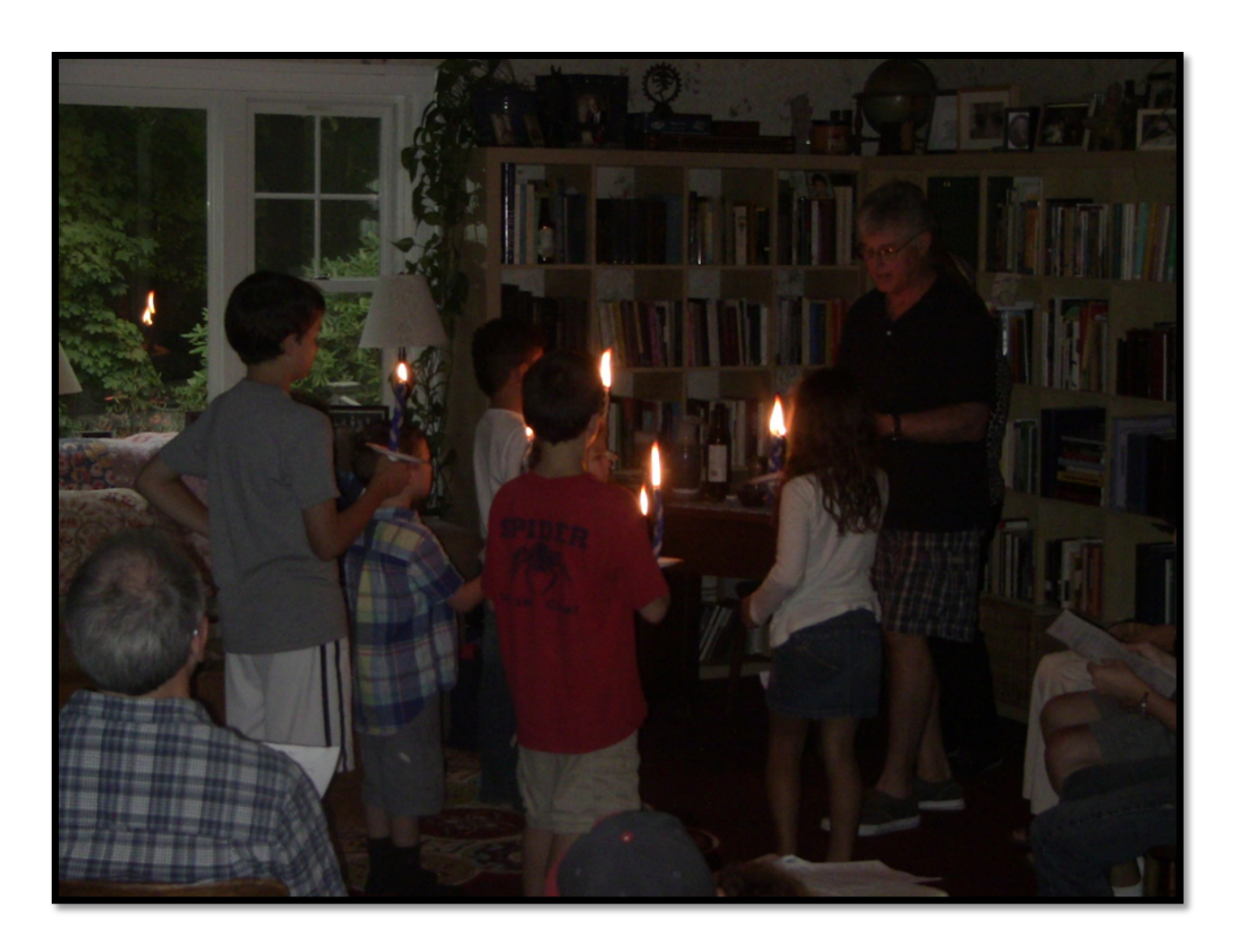
Figure 3: The cantor (not seen here) and an assistant light Shabbat candles for the children.

utilize formal syntax and precise language to convey information, but that is only one thing that language can do.<sup>18</sup>