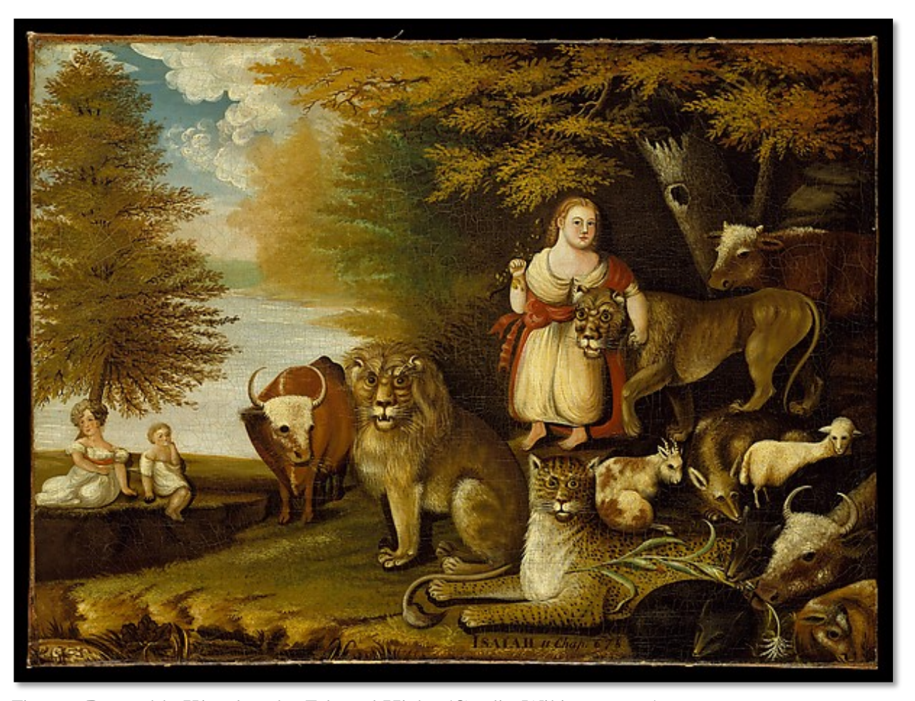
Figure 5: Peaceable Kingdom by Edward Hicks.