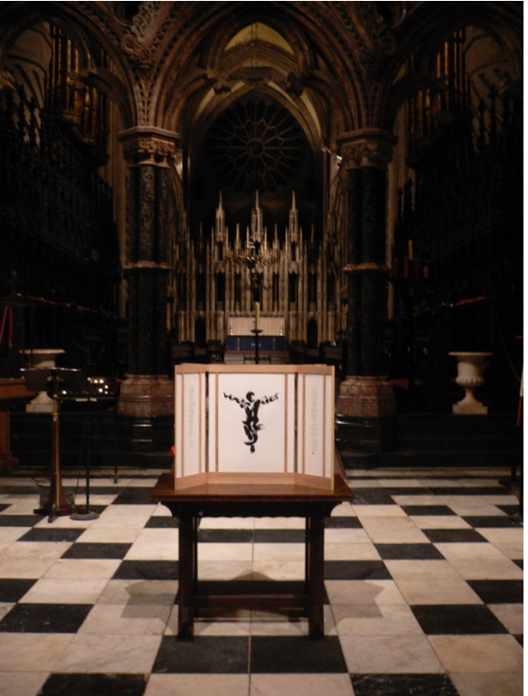
Image 4: Photo of AIDS Icon (by Ewan Clayton, 2005) displayed in front of the altar of Durham Cathedral. The photo is a close-up of the image above, with a clearer view of the chancel.