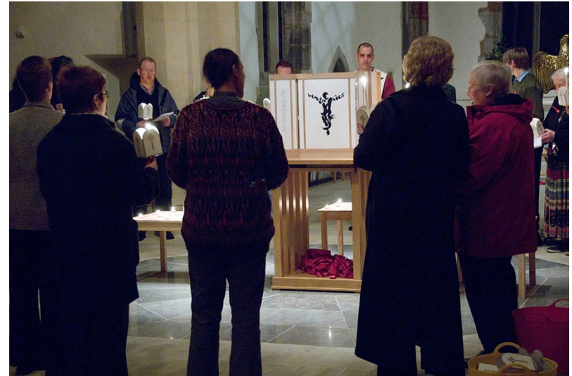
Image 15: Image of AIDS Icon , by Ewan Clayton (2005), being used at a service at St. Brandon's Church, with attendees encircling it.

Clayton also describes this work as "a kind of portable shrine that could be carried in procession," and supplied images of a special service at St. Brandon's Church in Brancepeth which uses it (see Image 15).<sup>60</sup> Here it functions as a contemplative space in three dimensions. Some of its viewers see the contemplative backside, others see the Jesus and prayer in the front. Images of the service also depict several people wrapped in cords or ribbons, in red echoing the AIDS ribbon (see Image 16).