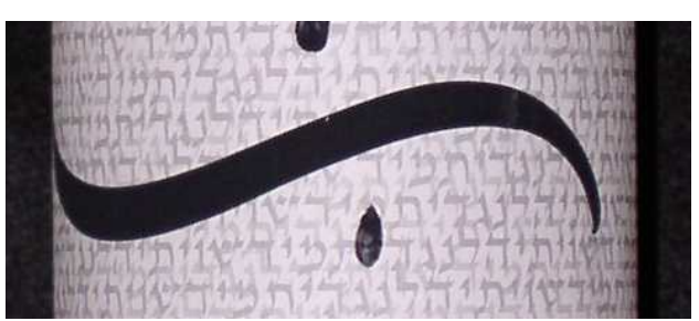
Image 11: Close-up of the letter tav ( n ) in Shivity Column, by Izzy Pludwinski (2002–5).

This script invites the viewer to "Ask, and it will be given you; search, and you will find" (Luke 11:9, NRSV). Similarly, see Pludwinski's highly stylized tav ( n ) in Image 11. Like Islamic calligraphic designs of the bismillah , the phrase on these columns would be hard to decode unless the viewer already knew what it was supposed to say. Pludwinski makes one column easier to decode by writing the phrase in formal script as a lighter backdrop.<sup>46</sup>