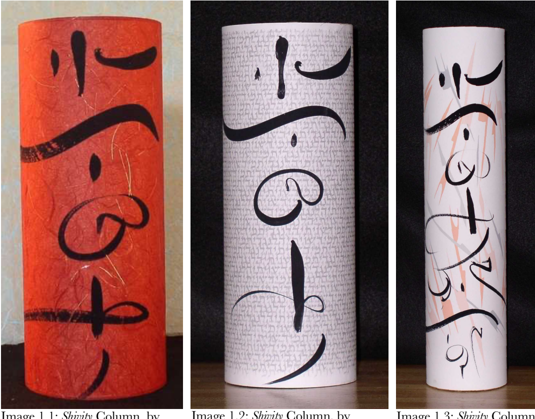
Image 1.1: Shivity Column, by Izzy Pludwinski (2002–5)

Pludwinski created three Shivity columns (Image 1) between 2002 and 2005.