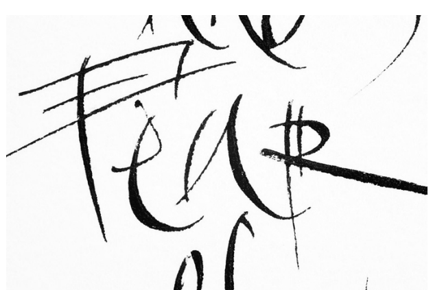
Image 8: A close-up of "Others" from AIDS Icon , by Ewan Clayton (2005) Photo: Ewan Clayton