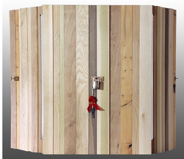
Image 14: Image of closed triptych, AIDS Icon , by Ewan Clayton (2005).

Clayton made his icon for liturgy, not just display. Two features invite viewers to engage with it as a liturgical object. First, the triptych opens and closes. When closed, the triptych has a padlock suggesting the secrecy and stigma around HIV/AIDs—another kind of concealing and