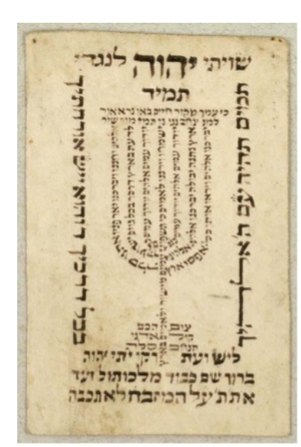
Image 17: Shivity with Hebrew text in the form of a menorah. Image in Det Kongelige Bibliotek, author unknown - 18th or 19th century shiviti Det Kongelige Bibliotek, Denmark (Department of Oriental and Judaica Collections, Cod. Heb. 46:5).

The Shivity columns indeed draw on a tradition of synagogue art: Shivity plaques. These pair "I set the Lord before me always" with Psalm 67 in the shape of a menorah, often accompanied by kabbalistic texts or meditative aids. This tradition dates at least to the eighteenth century.<sup>64</sup> Shivity plaques are placed on the walls of the synagogue, on the Torah reader's table, and in prayerbooks (see Image 17).<sup>65</sup>