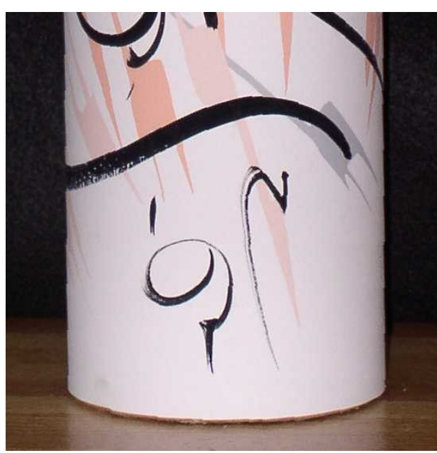
Image 7: Close-up photo of the bottom of Shivity Column, by Izzy Pludwinski (2002–5).

brush movement just as they would when watching a motion picture."<sup>27</sup> Pludwinski calls these works "Zen" because "in the making of these pieces the preparation of self was as important, if not more important than the final result, hopefully reducing, if not dissolving, the dichotomy of product and process."<sup>28</sup> The eye follows his movement. It senses his intention, his attention, his feelings expressed in the qualities of lines.