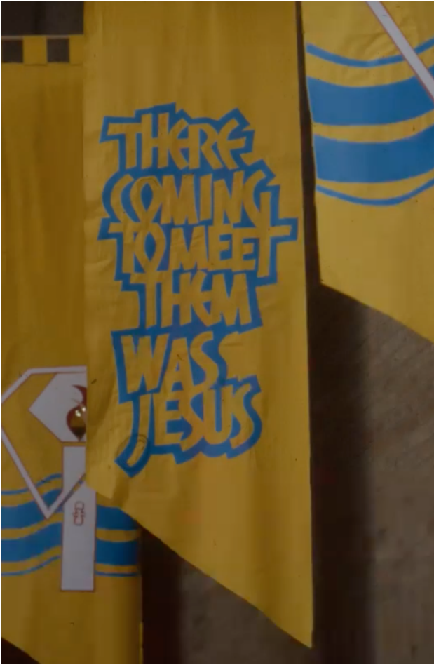
Image 6: Photo of liturgical banner, by Ewan Clayton (1980s).

When he was a monk, Clayton made liturgical banners with lettering designs (see Image 6), employing "words that had a contemplative space within them... a kind of visual chant." One simply reads "There coming to meet them was Jesus" (Matt 28:9).<sup>26</sup>