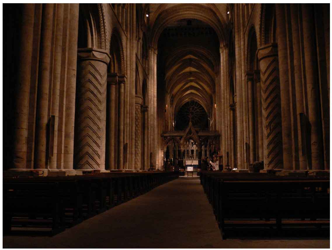
Image 3: Photo of AIDS Icon (by Ewan Clayton, 2005) displayed in front of the altar of Durham Cathedral. The photo is taken from a distance, within the nave, pews on either side.